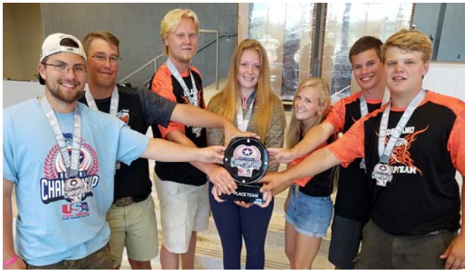
Delano Tigers at the National Trap Championship, Delano Herald-Journal