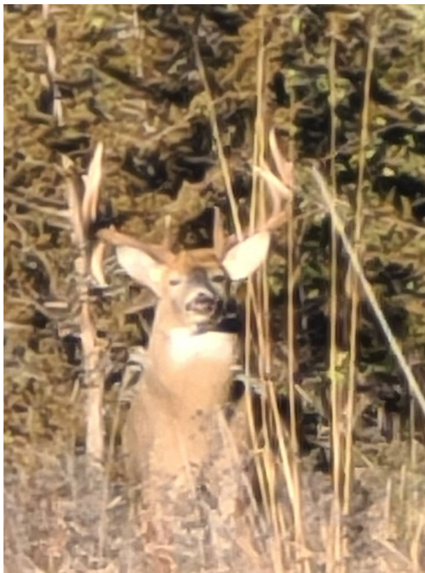
This guy was hanging out not far from the club.