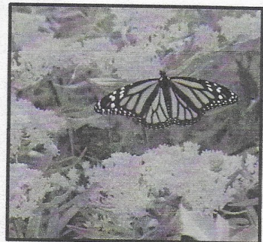
Monarch on Butterfly milkweed

All tree bundles priced at $35.00 Sales tax included